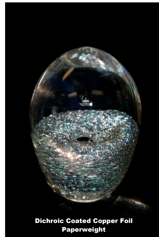
Dichroic Coated Copper Foil Paperweight