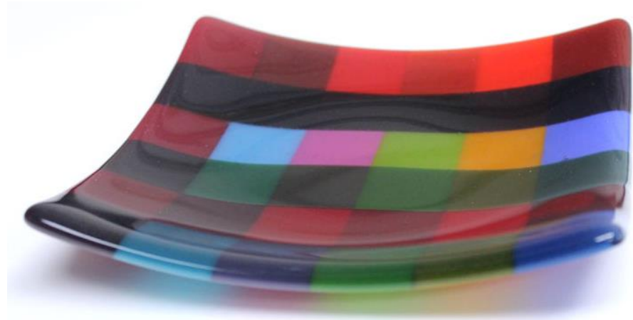
Simple to make but professional looking: create a bowl using our Strip Saver packs.