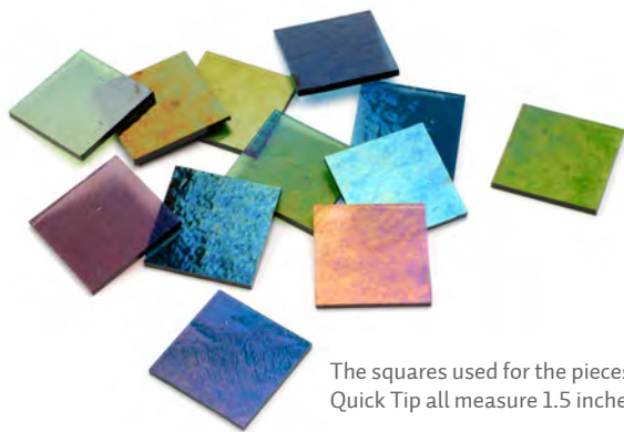
The squares used for the pieces in this Quick Tip all measure 1.5 inches (38 mm).

You can transform a single sheet of Rainbow Iridescent glass into a shimmering design by cutting it into squares and reconfiguring the pieces.