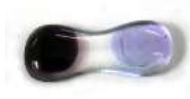
Fig. 3 – Less than 6mm