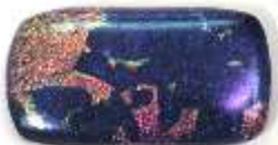
Fig. 1 – Dichroic face up

If the design is thicker than 6mm, the glass will flow out in the kiln and again distort any patterned dichroic you have used ( Fig. 4 ).