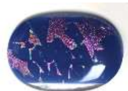
Fig. 4 – More than 6mm