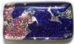
Fig. 2 – Capped Dichroic